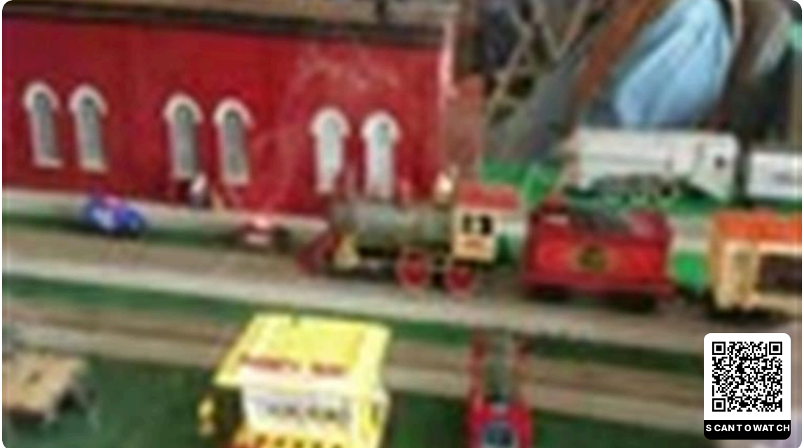
Ray's Rail Station