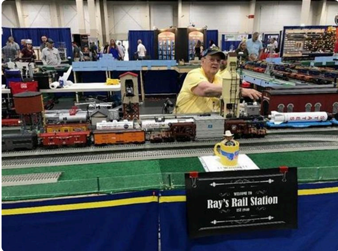
Ray's Rail Station