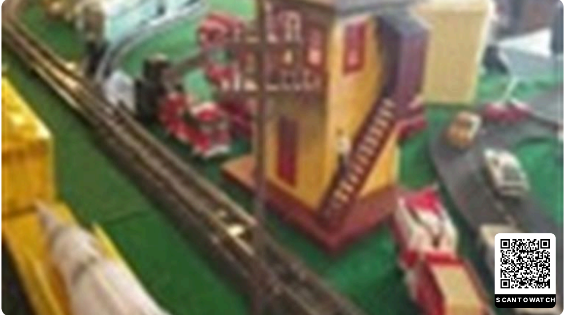
Ray's Rail Station